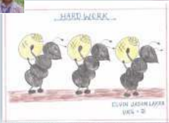
ELVIN JASON LAKRA - BLOSSOMS- D