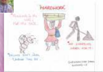
GURSHAAN SINGH BHO GAL- BLOSSOMS- A