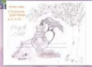
PLAKSHA BARMAIYA -BLOSSOMS- A