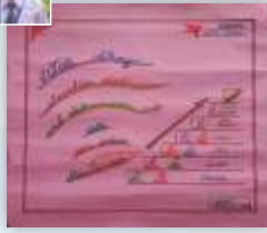
AYUSH CHATTERJEE- GRADE - II C