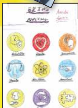
Aarchi Gour (IV-A)