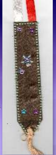
UPANSHU GUPTA - 2B