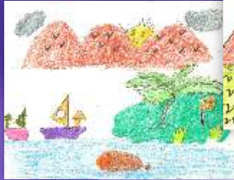
AVISHI RATHI - 1B