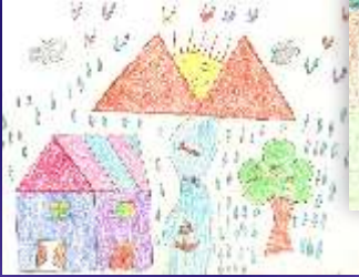
INAYA FATIMA - 1C