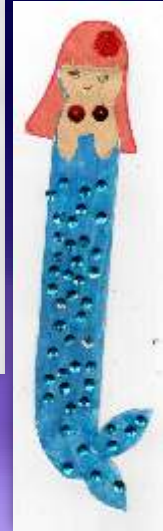
RIDDHI BANSAL - 2B