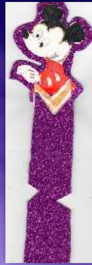
VAIBHAV DAS - 3B