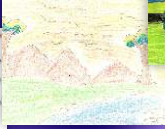
DIVYANSH SINGH JATAV - 3A